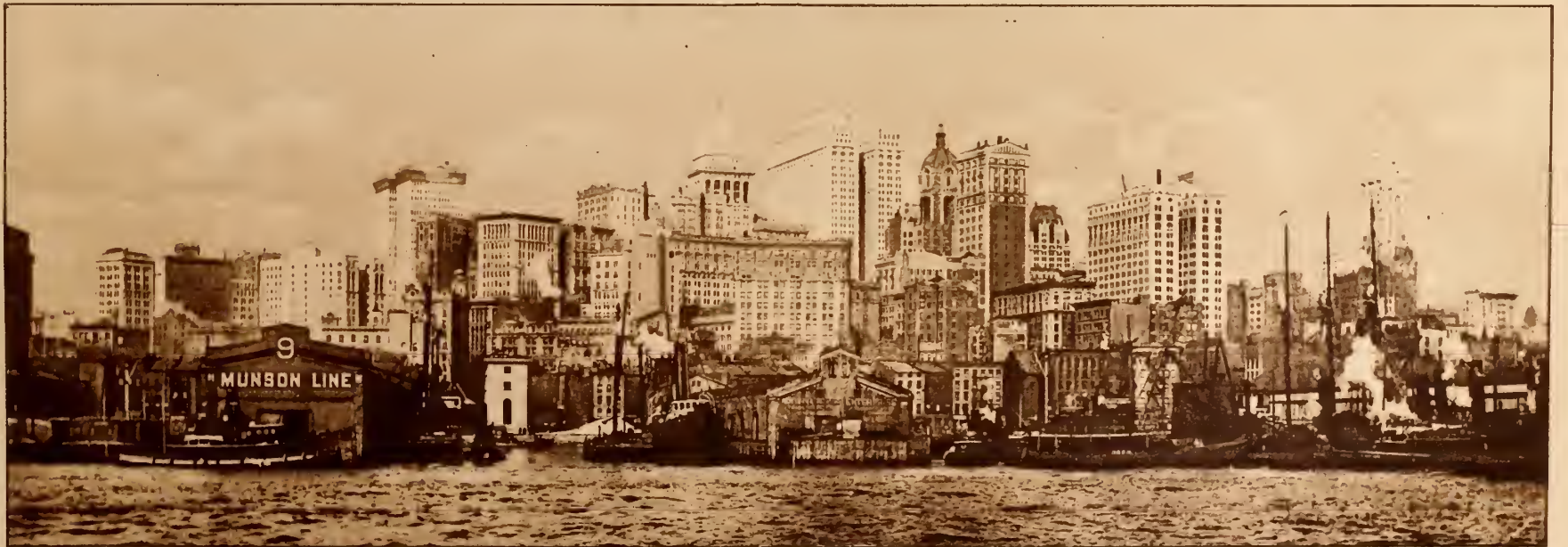
VIEW OF NEW YORK SKYLINE FROM JERSEY CITY. Total cost of skyscrapers estimated at $2,500,000,000, and business enterprises represent over $250,000,000,000.